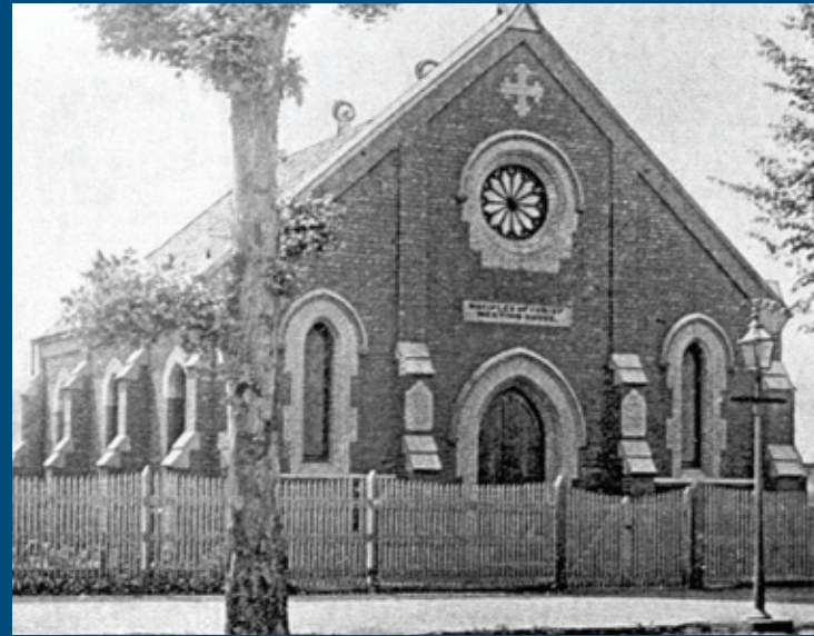
Dawson St Chapel circa 1879

2023 • Plans to expand our spaces for families.