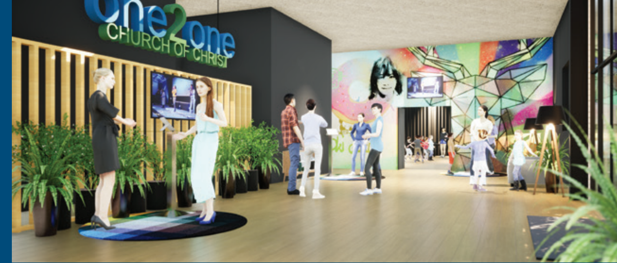
An artist's impression of an upgraded entrance space to our kids' and youth ministries.

We stand on the shoulders of generations of godly leaders. Through the history of our church, we have had countless people provide godly leadership and lay biblical foundations that we continue to build upon. Despite challenging circumstances, our generation has continued this tradition of growth over the last decade. Today, we have another exciting opportunity to invest in the next generation - those who will follow in our footsteps.