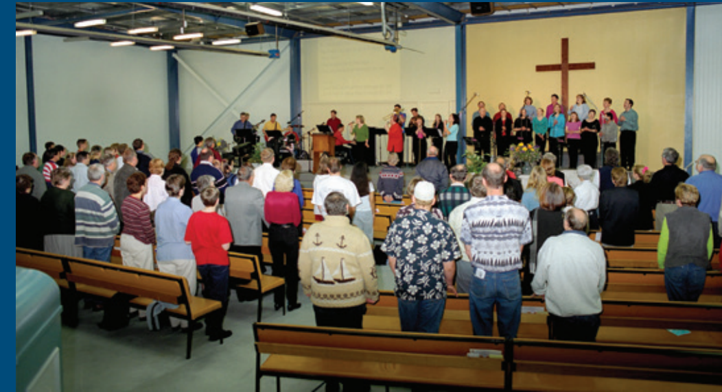
The new Gillies St South church home is dedicated (2000).