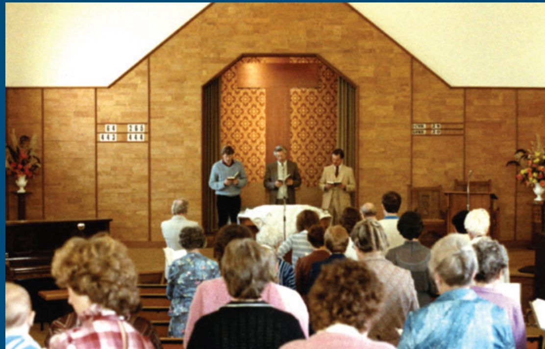
Dawson St Chapel circa 1982