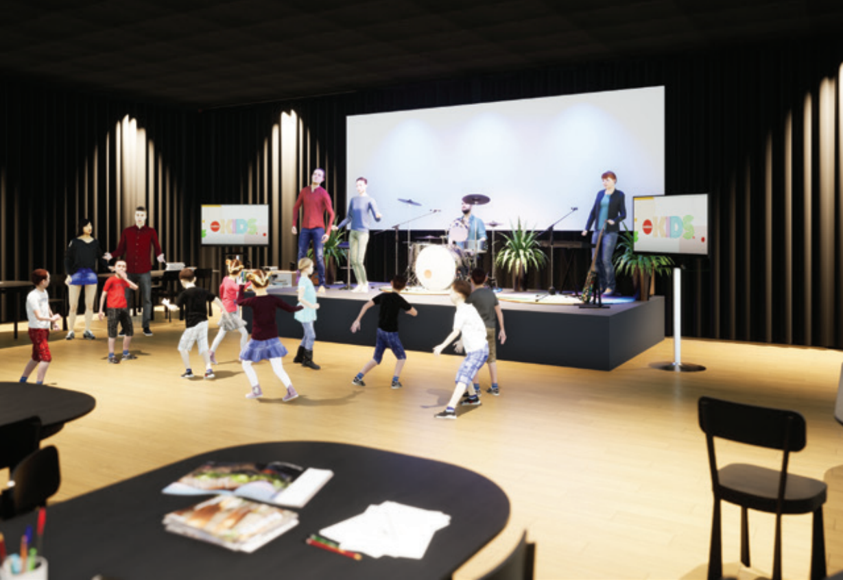
An artist's impression of our future indoor space for kids' and youth ministries.

Each person should give what they have decided in their heart to give, not reluctantly or under compulsion, for God loves a cheerful giver. [2 Corinthians 9:7]